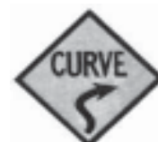
Connie Loves those Curves!