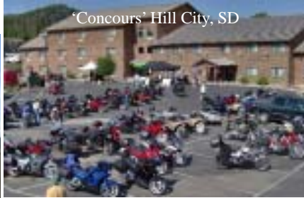
'Concours' Hill City, SD