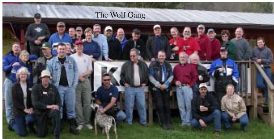
The Wolf Gang