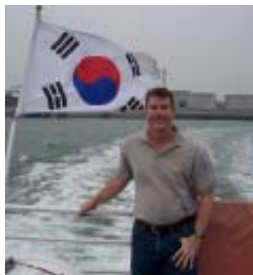
Picture is me in the Pyeongtaek (Pea-young-tak) harbor, home of the Pyeongtaek Port, a logistical hub of North-east Asia