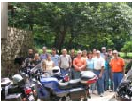
'Sport Touring At Its Finest'