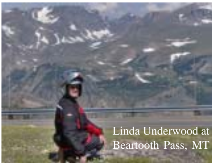
Linda Underwood at Beartooth Pass, MT